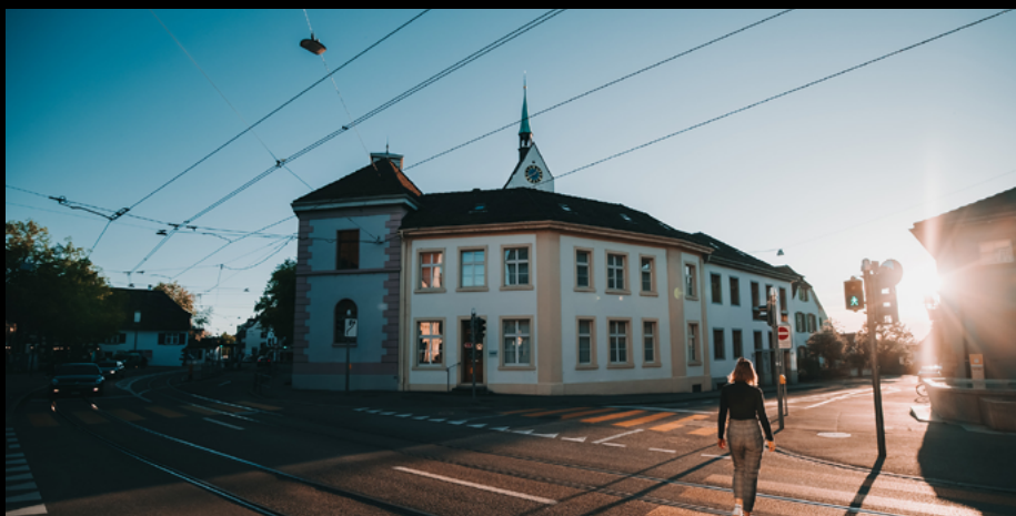
Riehen Village Center