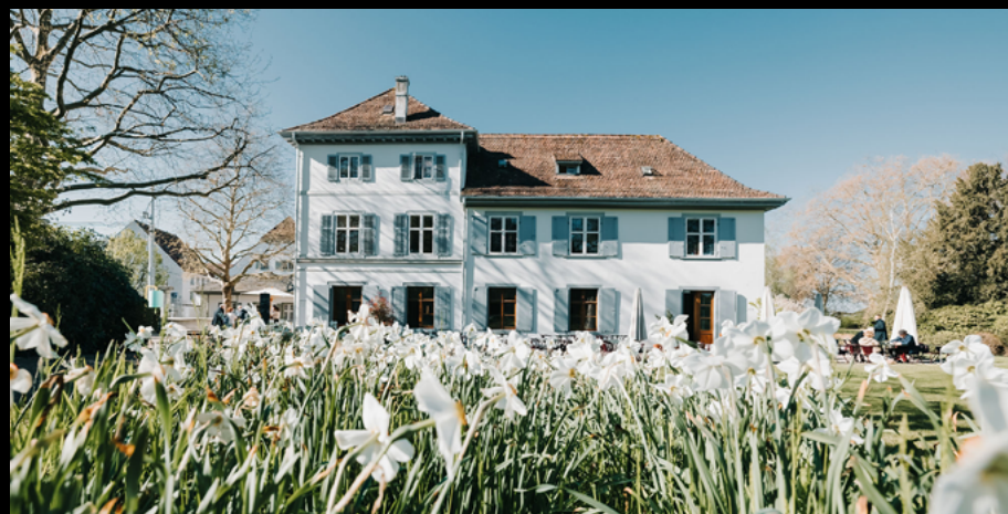
Spring in Riehen