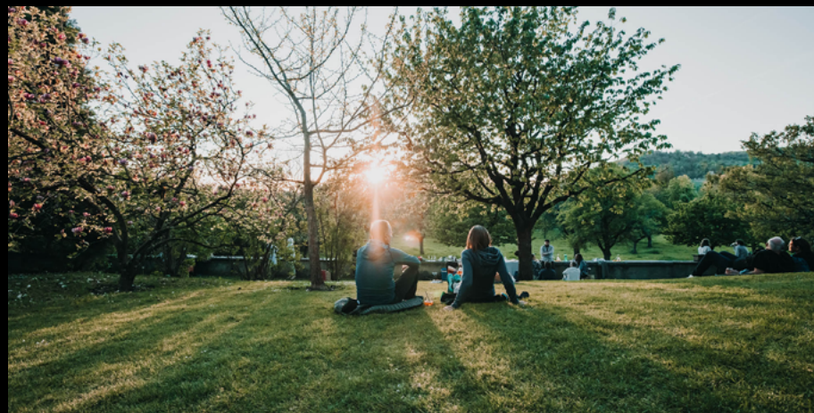
Fondation Beyeler Park